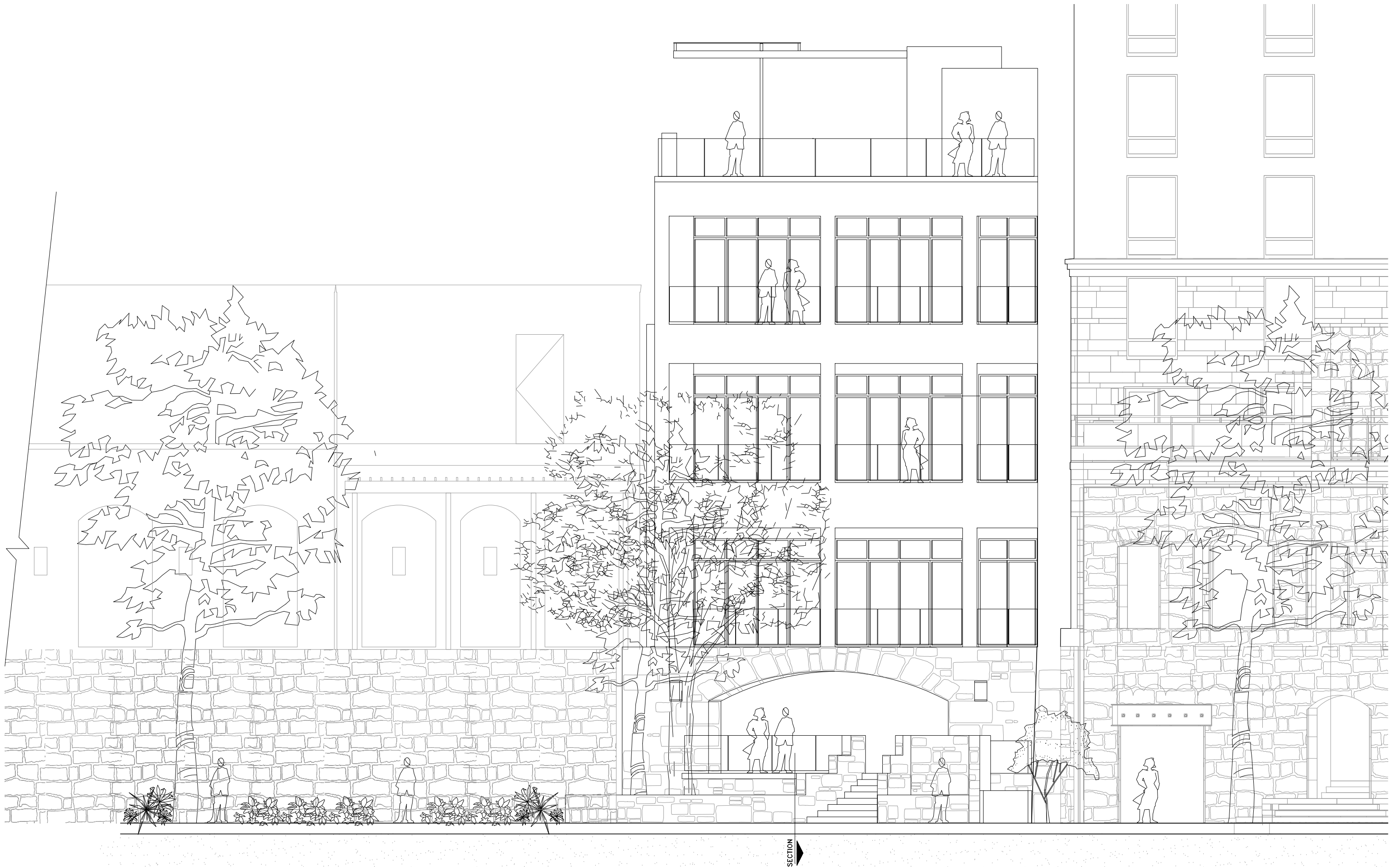
EAST ELEVATION & SECTION - SAN ANTONIO RIVERWALK